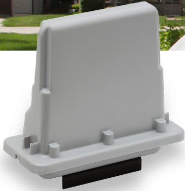
RESIDENTIAL LTE CELLULAR UNIT