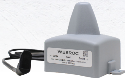
LPWAN TANK MONITOR